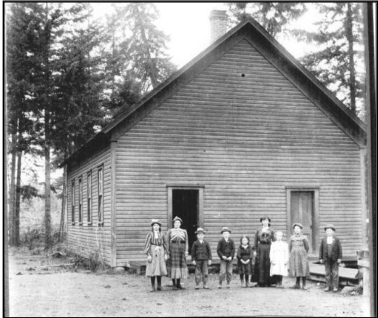
Jeans School 1904. The building was originally built by the Amish Mennonites as a church in 1896. It is located on what is now Jeans Road not far from Ellmaker Road.